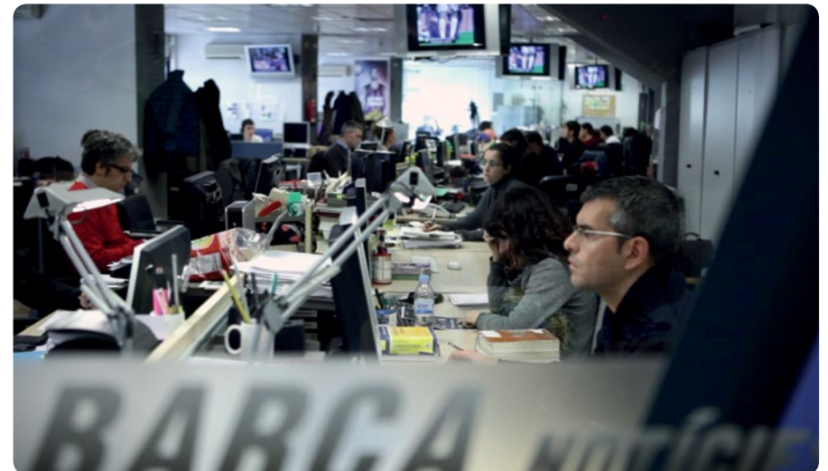
Newsroom at Barça TV