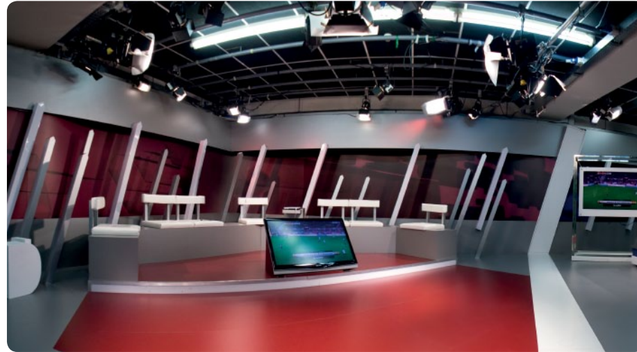
Main studio at Barça TV