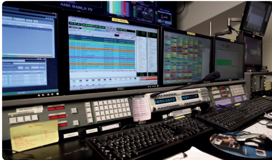
VSNMULTICOM manages the MCR automation at Barça TV