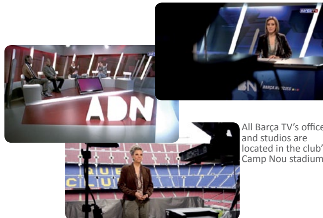
All Barça TV's offices and studios are located in the club's Camp Nou stadium