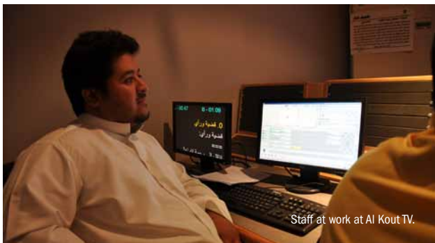
Staff at work at Al Kout TV.

“In addition, VSN’s ability to provide support in the Arabic language was a key reason for choosing them,” he adds.