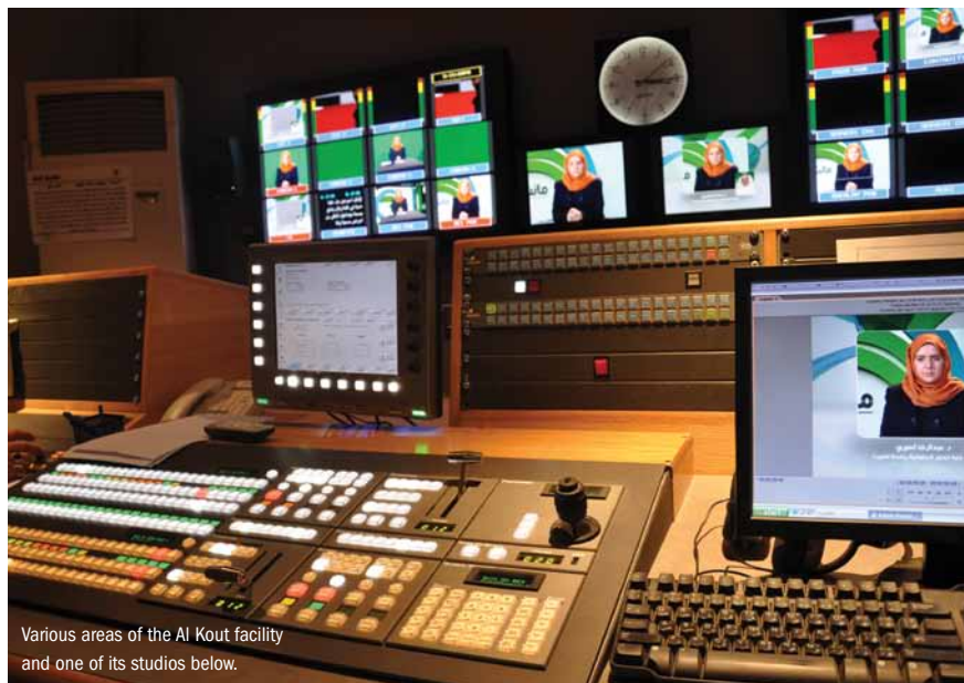
Various areas of the Al Kout facility and one of its studios below.

workstations as well as a redundant VSNAIRNEWS playout server and two teleprompter systems.