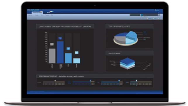
VSNEplorer's BI Module

This way, companies can rely on these reports for better making business decisions and analysing their companies' performance , avoiding the need to perform this task manually or hire additional third party systems to carry it out.